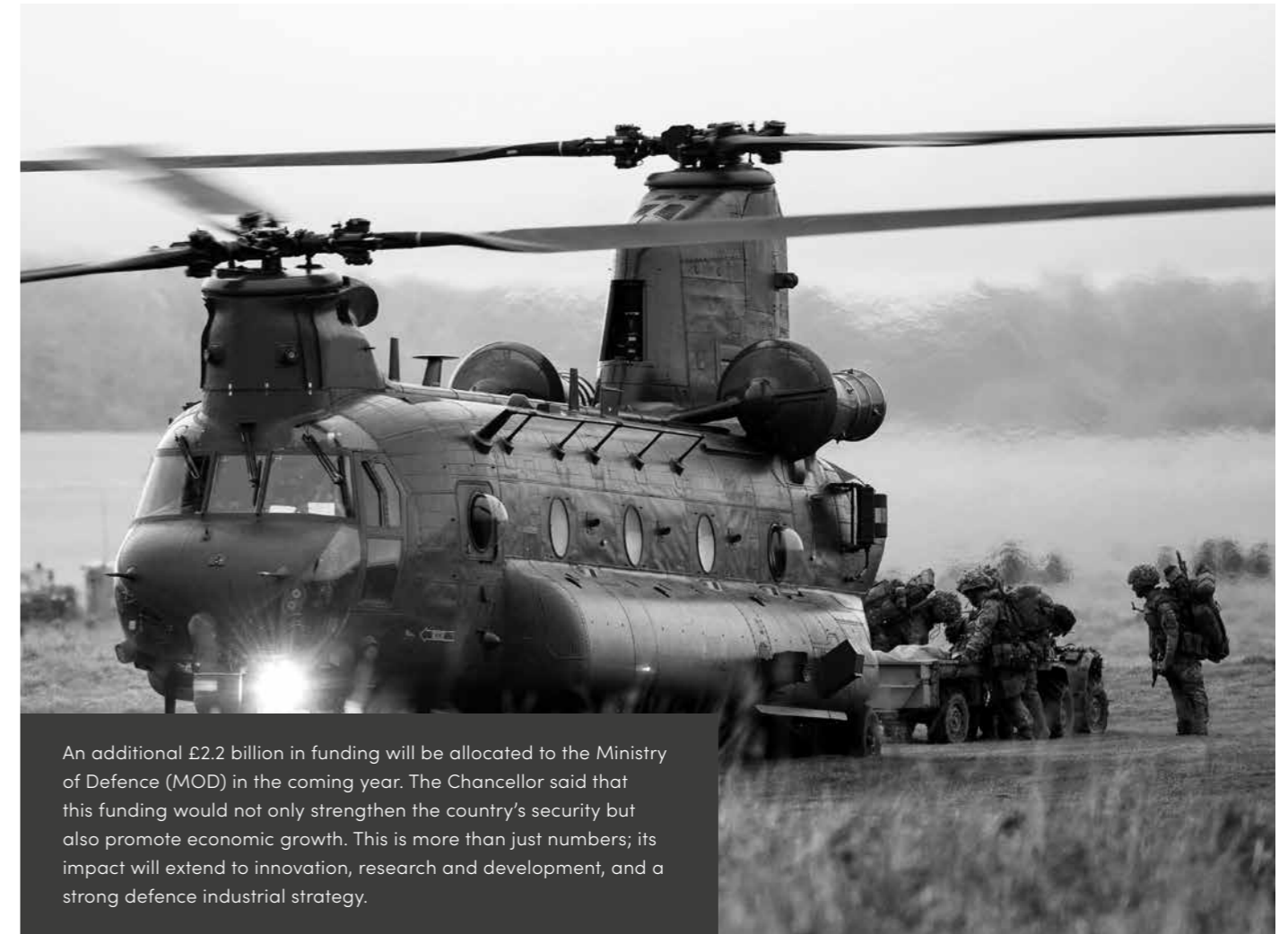
An additional £2.2 billion in funding will be allocated to the Ministry of Defence (MOD) in the coming year. The Chancellor said that this funding would not only strengthen the country's security but also promote economic growth. This is more than just numbers; its impact will extend to innovation, research and development, and a strong defence industrial strategy.

The Spring Statement highlights a £3.25 billion Transformation Fund designed to overhaul public services. This initiative seeks to seize opportunities presented by advanced technologies like artificial intelligence and digital innovation.