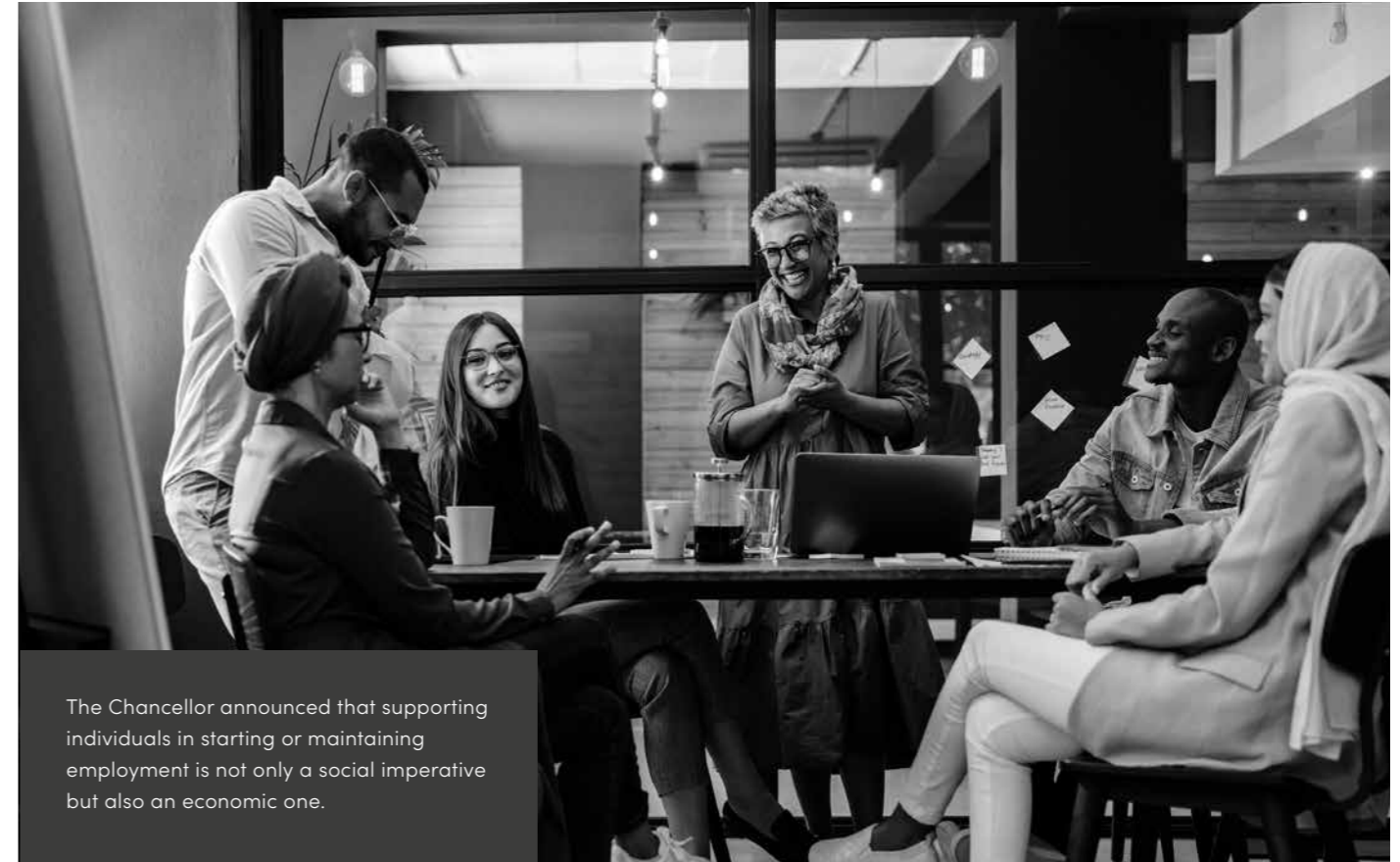
The Chancellor announced that supporting individuals in starting or maintaining employment is not only a social imperative but also an economic one.

To address the gap between current welfare assessments and changing societal needs, the government will conduct a review of the Personal Independence Payment (PIP) assessment. Policy experts, stakeholders and