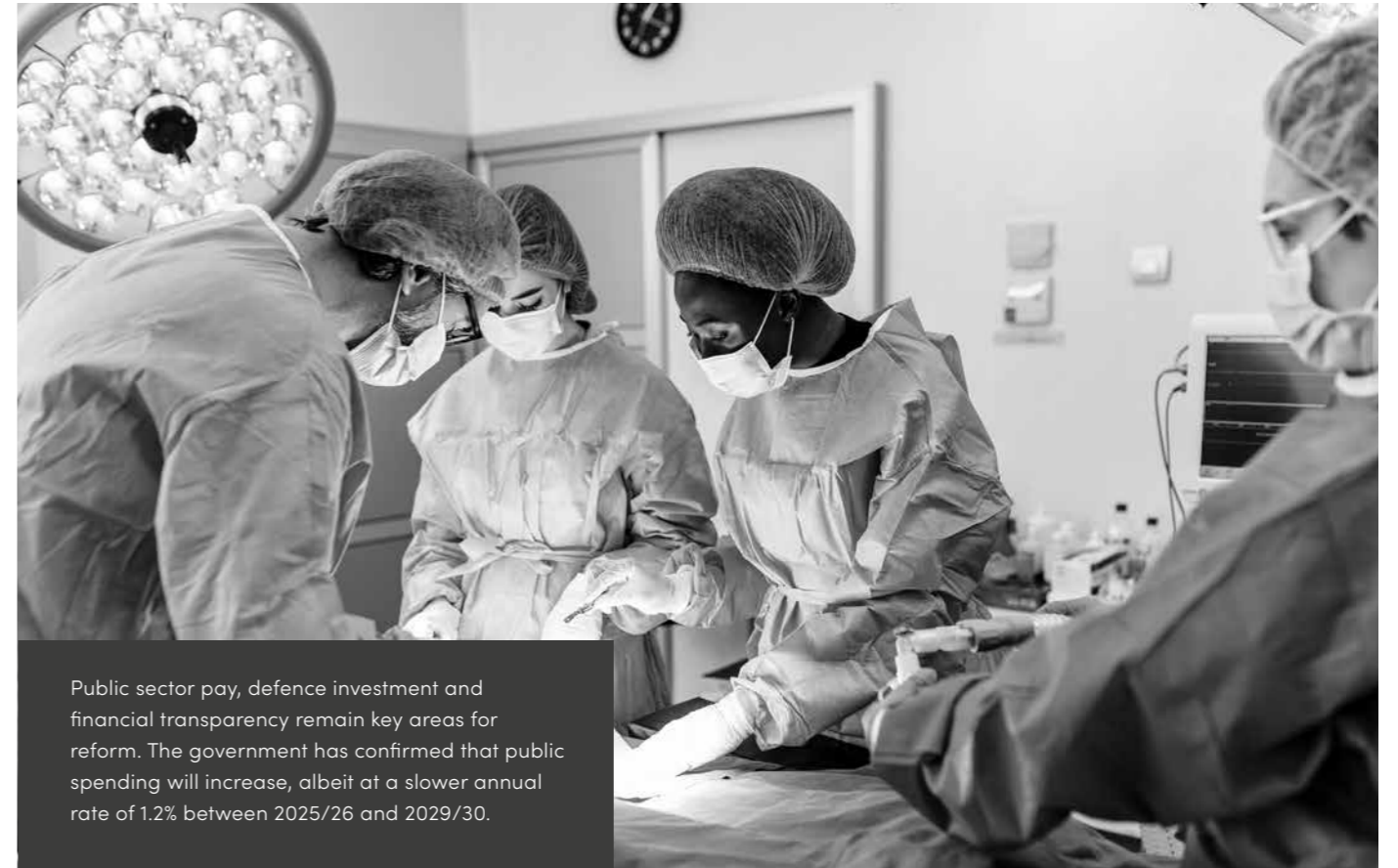
Public sector pay, defence investment and financial transparency remain key areas for reform. The government has confirmed that public spending will increase, albeit at a slower annual rate of 1.2% between 2025/26 and 2029/30.

Central to this goal is workforce reform, with the Chancellor emphasising plans to ensure public sector pay increases are closely aligned with productivity gains. Particular emphasis will be placed on enhancing digital competencies, aiming for