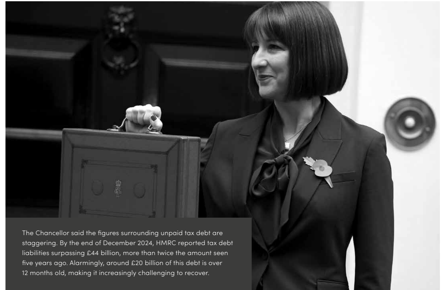
The Chancellor said the figures surrounding unpaid tax debt are staggering. By the end of December 2024, HMRC reported tax debt liabilities surpassing £44 billion, more than twice the amount seen five years ago. Alarming, around £20 billion of this debt is over 12 months old, making it increasingly challenging to recover.

Cracking down on more deliberate forms of non-compliance is another key priority. Earlier this year, the government launched a series of consultations on important measures aimed at closing the tax gap. These include plans to enhance the use of third-party data for automation, bolster HMRC's power against tax advisers who facilitate non-compliance and curb marketed tax avoidance schemes that leave clients with hefty, unexpected bills.