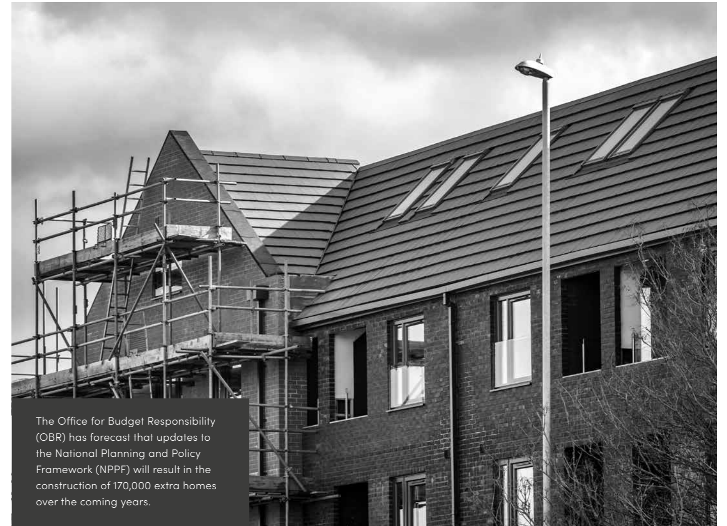
The Office for Budget Responsibility (OBR) has forecast that updates to the National Planning and Policy Framework (NPPF) will result in the construction of 170,000 extra homes over the coming years.

The Chancellor said that investment remains a key component of the Plan for Change. Over the next five years, the government has committed £13 billion to capital infrastructure projects and launched a construction skills initiative to train up to 60,000 additional workers. To tackle the UK's housing